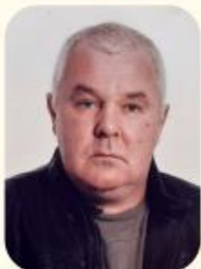
Fintan Lalor The Courthouse, Harper's Lane, Portlaoise