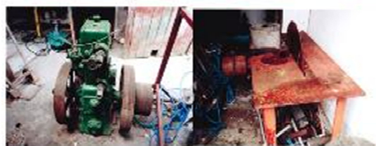
Lister Diesel Engine and Saw Belt Bench