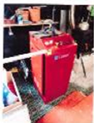
CASSESE Picture Framing Machine