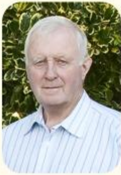
Tommy Fingleton Park, Ratheniska

OUR PRAYERS ARE ASKED FOR THOSE WHO DIED RECENTLY ;