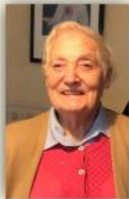
Louise Allen Grattan Street, Portlaoise