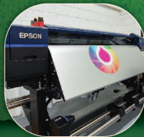
WIDE FORMAT PRINTING