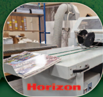
ID CARDS PRINTING