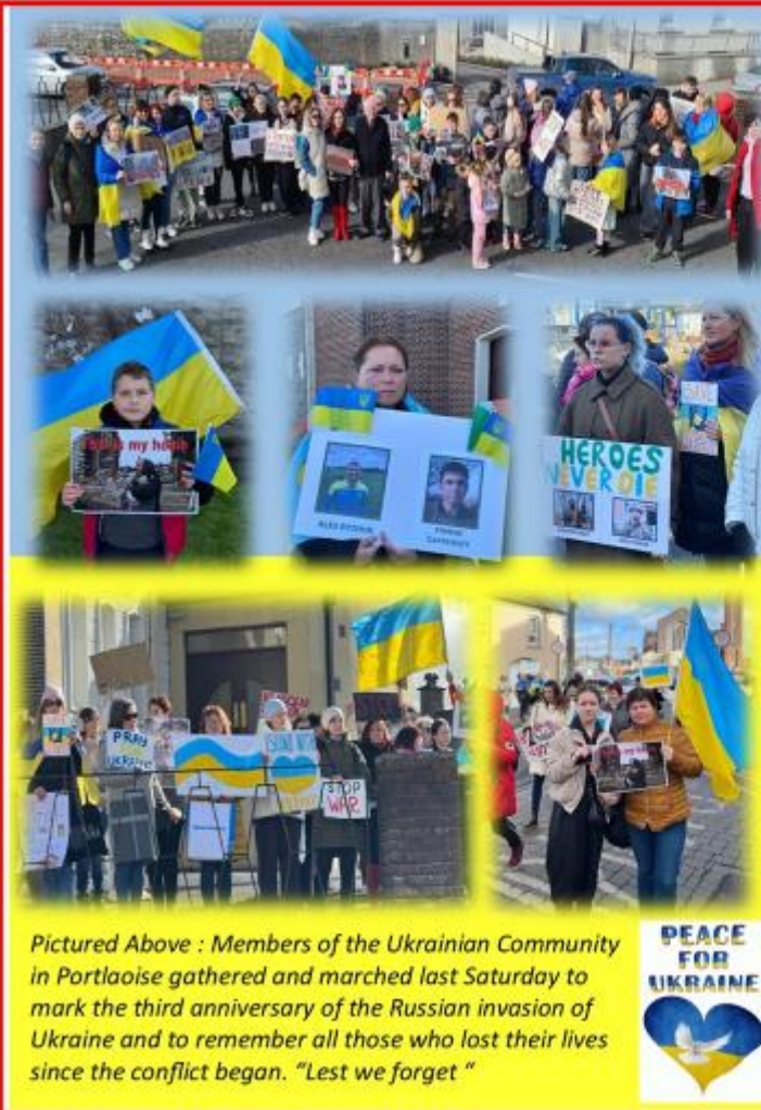
Pictured Above : Members of the Ukrainian Community in Portlaoise gathered and marched last Saturday to mark the third anniversary of the Russian invasion of Ukraine and to remember all those who lost their lives since the conflict began. "Lest we forget"