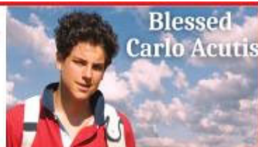
Blessed Carlo Acutis

Sunday 27th of April, Carlo Acutis, will be formally canonized and declared saint. This will take place in an open air ceremony in Saint Peters square the Vatican. He will be the first saint, born in this new Millennium. His life is a testimony, to how we can achieve wonderful fruits, when we are open to the spirit of the living God. Carlo has a particular attraction for young people, he was accustomed to what it is to live in a culture so influenced by technology and social media. Despite his young life, his faith, resilience, courage and deep compassion, offers inspiration to all our lives. In this Easter Season we are encouraged to indulge in the power of hope. Easter is a time of rich grace. I pray, these days, we all will feel a sense of new life and engage with that Easter message to begin again.